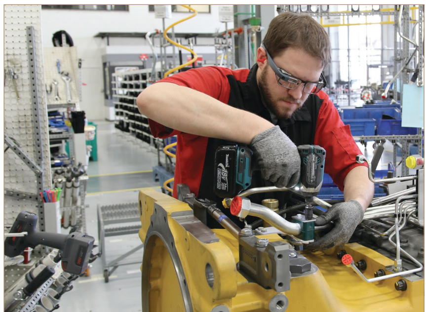
Operators don't have to stop work to check their binders or computer to know what to do next

www.google.com/glass/start/ www.plataine.com/